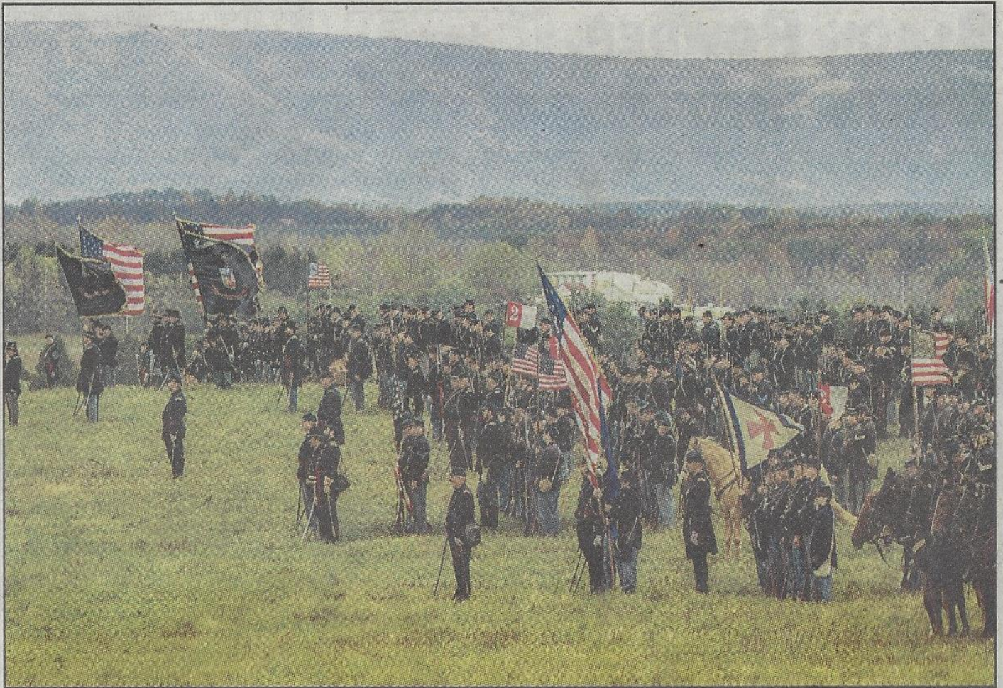
The Union Army is in formation for the Battle of Cedar Creek.